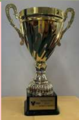
“The Cup” on display at the club this week.