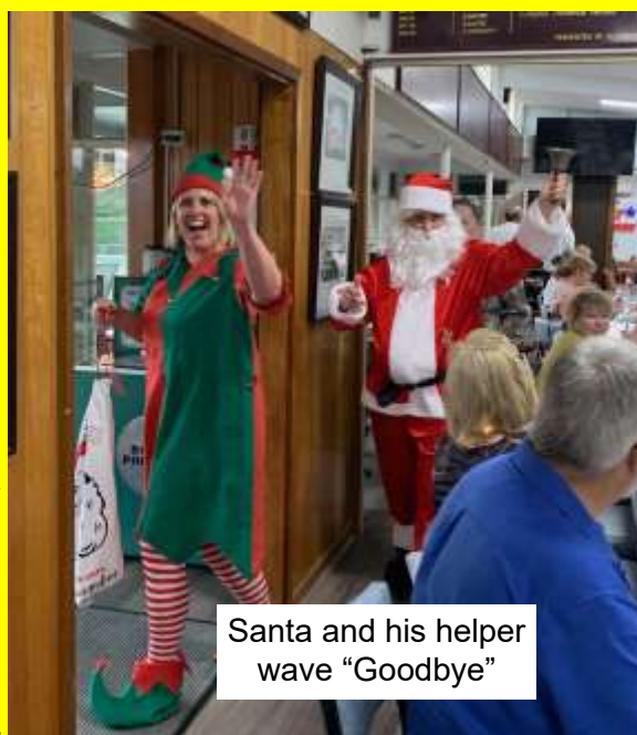
Santa and his helper wave "Goodbye"

Best of luck for the rest of the season.